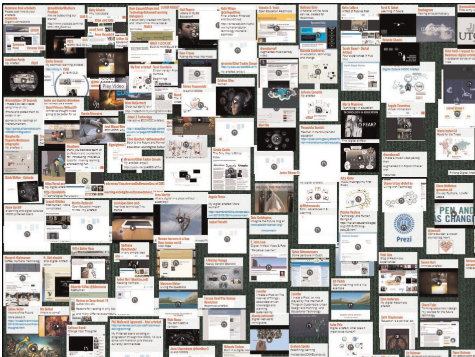
Figure 1. A section of the EDCMOOC digital artefact Wallwisher, illustrating the profusion of multimodal enactments http://padlet.com/wall/edcmooc_artefact

Figure 1 depicts a section of the ‘EDCMOOC Digital Artefact’ Wallwisher, a message based collaborative space that came to accommodate 331 depictions of digital artefacts from the course. While this web page exposed only a small proportion of the 1719 final assignments submitted, and a fraction of the digital work created throughout the duration of the course, it is illustrative of, we suggest,