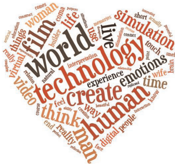
Figure 2. ‘World Builder: a crowd-sourced tag heart’ by John O’Neill, digital artefact created for the EDCMOOC: http://www.tagxedo.com/artful/f2c519c2502249f9

The text used for this digital artefact was produced in response to one of the video resources used in the course. ‘World Builder’ (Branit 2007) is a short sci-fi film, depicting a male character that creates an idyllic computer generated holographic environment for the cognitive enjoyment of an apparently comatose female. It is a film which features themes of simulation, immersion in technology, virtuality, and artifice, and these were the interpretations proposed by the course tutors alongside an