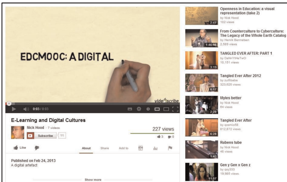
Figure 3. ‘E-learning and Human 3.0’ by Nick Hood, digital artefact created for the EDCMOOC: http://www.youtube.com/watch?v=6JPq60Hd8CE

Our second example – the digital artefact ‘E-learning and Human 3.0’ – was created with ‘Videoscribe’ presentation software, rendered as a video and uploaded to You Tube (Figure 3). It exemplifies a number of layered processes that are embedded in digital systems, ordered through multiple relations and contingencies, and typical of a range of EDCMOOC multimodal practices. The presentation consists of text and images, accompanied by the animated reproduction of a hand pre-programmed by the software to appear as if it is inscribing the words and sketching the visuals. Such presentations are created by inputting and positioning text, choosing from a library of pre-set images, and selecting a preferred limb with accompanying writing implement for the animation (see Figure 4). Once the arrangement is complete, the software provides a ‘play’ feature which will animate each element in the presentation