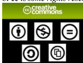
Fig. 2 Creative Commons

Within the use of OER, which by per definition concerns free educational resources, there are licenses for use and reuse. Creative Commons (CC) licenses 3 , the most common tool, provides simple, standardized alternatives to the all rights reserved paradigm of traditional copyright, in Fig. 2. With a Creative Commons license, the copyright always belongs to the producer, who always will be credited, but with cc allowance resources can be used for copying, distributing and also for commercial issues but only on the conditions specified and decided by the producer, using the four cc symbols in combinations. The principle of cc is some rights reserved .