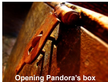
Fig. 4 Pandoras box.

Acceptance of OER opens up Pandora's box in that it demands that a host of other issues be resolved: teacher's role, student's role, university's role, review of intellectual properties, practices, administrative routines, teacher and student support. It raises questions about how universities will react to students taking charge of their learning in ways outlined by the OER University [22] and DoItYourself [24]. The increasing interest in certifying informal, OER-based learning seen in projects such as Mozilla's Open Badges initiative will also change the way we view assessment and validation and the question is how the formal education system will be able to accommodate such innovation [53]. Will they entrench themselves further in their traditional role or will battle really commence?