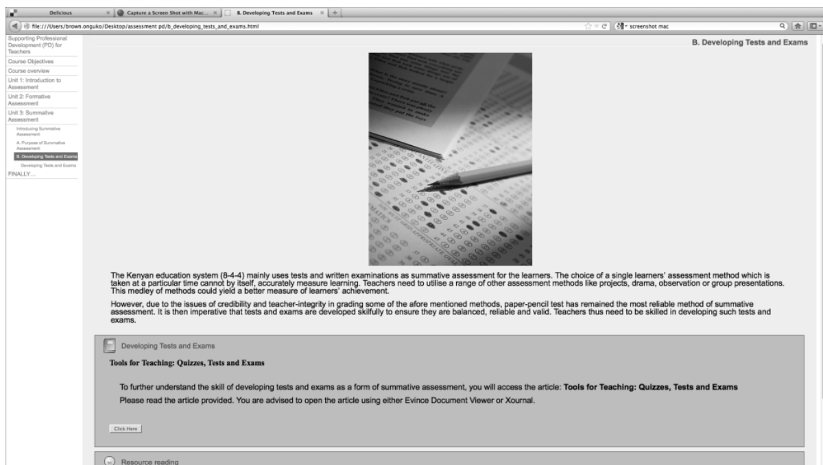
Figure 2: Screenshot of offline web content

The blended learning content designed by the PDTs is evident in the screenshot in Figure 2. It was heartening to realize that PDTs referred to division of labor when talking about their role and that played by the ‘digital natives’ because in jifUNzeni field test, division of labor was an important component together with development of a community as in activity theory (Engestrom 1987) which is an important guide for the jifUNzeni blended learning approach.