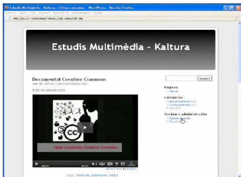
Figure 3: Integration of Kaltura in the UOC Campus through Wordpress

The commitment to the development of collaborative audiovisual projects using open resources and social software tools in higher education is a way of promoting the spirit of collaboration and open access to cultural creation. It should be one of our core objectives as critical and independent users of digital technology in contemporary society.