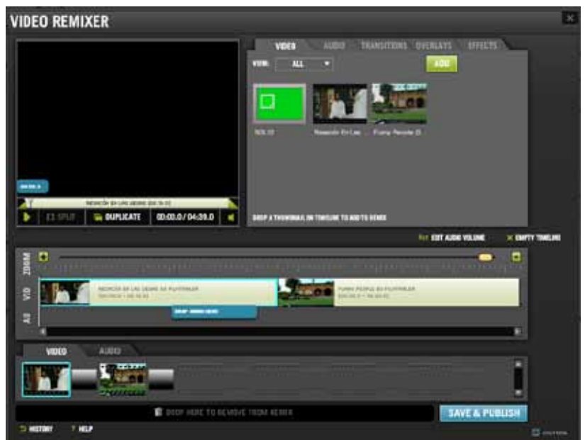
Figure 2: Kaltura's advanced video editor

Kaltura enables collaboration during the editing and composing processes between students that are members of a working team. Users have to create accounts and can upload raw video material. Once done, they can edit and compose their clips sharing ideas, knowledge and skills. When the project is